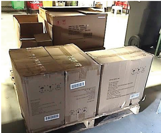
1. Receive the product.