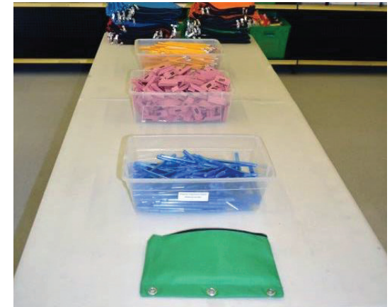
3. Unpack the boxes and stack them on the assembly line (complete a kit for example).