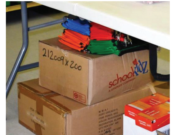
6. Box completed kits and prep for delivery to Classroom Central.