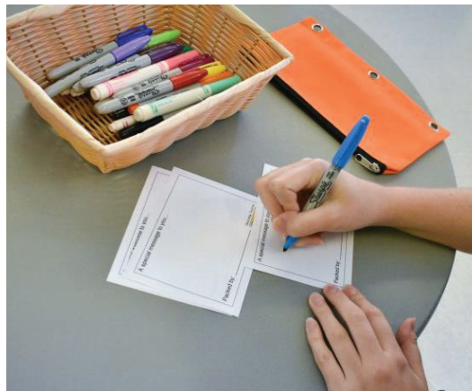
5. Participants write notes of encouragement and place them in completed kits.