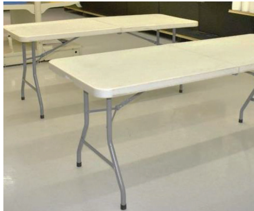
2. Gather tables & chairs, or reserve a meeting space, for your build.